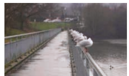
The balancing pond at Farnley, Leeds