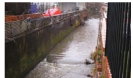
Wortley Beck in urban Leeds

Wortley Beck, like many urban waterways is a Heavily Modified Water Body (HMWB) which is failing WFD targets due to suspected diffuse urban pollution and suspected intermittent point-source discharges. The morphology of the beck also affects its species composition.