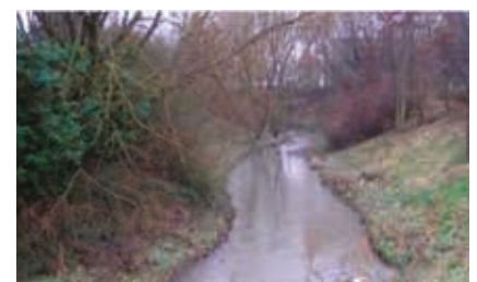
Wortley Beck close to the Leeds inner ring road